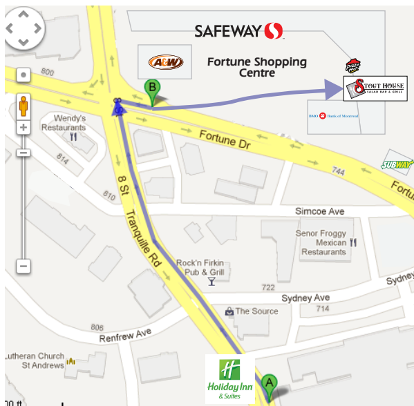
Directions from Holiday Inn to the Stout House